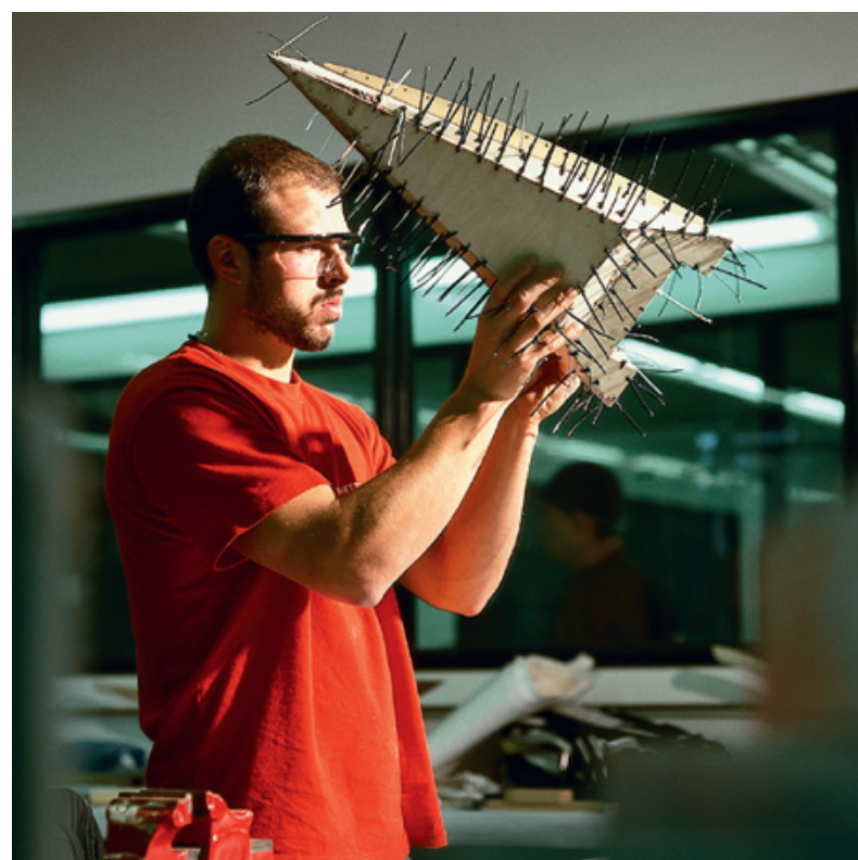
FEPs typically are one-term studio classes, in which department chairs and faculty work closely with sponsors, directing students in the production of blue-sky design prototypes.

NBC Universal (NBCU) is challenging Art Center students in the Film and Product Design departments to define and investigate compelling, medium-specific entertainment content for mobile, portable and broadband applications related to NBCU brands. The project will identify and explore the limitations of existing technology for portable media devices, such as cell phones, PDAs and MP3 players. It will also scrutinize the systems currently used to package these devices. Particular attention will be given to identifying opportunities for emerging markets. Students will be asked to design content-creation processes for the Asia-Pacific region that can be replicated in other global markets by incorporating local cultural relevancies.