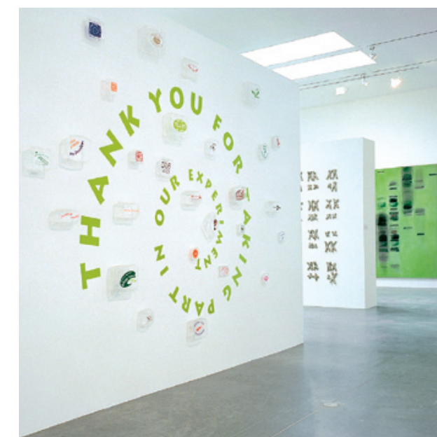
Williamson Gallery Patron Program members support the Alyce de Roulet Williamson Gallery, one of the treasures of Art Center's Hillside Campus.