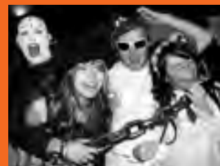
Students and alumni get spooked at the 2006 Art Center Student and Alumni Halloween Party, held on the South Campus rooftop.