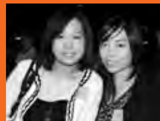
New graduates celebrate at the Summer 2007 Grad Show reception.

Pictured below are snapshots from recent Alumni Relations-sponsored events, which are held around the world and are designed to offer the global alumni community opportunities to socialize, learn, network and reconnect with each other. For the most current listing of events, visit the "Event Calendar" link on the alumni website at artcenter.edu/alumni . You can submit photos from alumni gatherings, both official and unofficial, to be included on the website by sending an email to alumni@artcenter.edu .